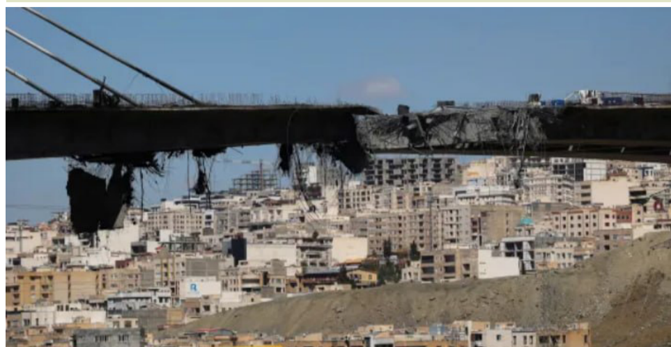
The B1 bridge was damaged in U.S.-Israeli strikes in Karaj on April 3, 2026

TEHRAN — The world is asking why the United States and Israel started an unwarranted war against Iran. The world was surprised that the war began while the talks were underway between Iran and the U.S.