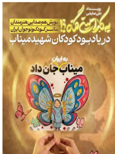
A poster for "To Which Sin?" national theater event

TEHRAN-The national theater event "To Which Sin?" is being staged across multiple Iranian provinces to honor the memory of the Minab schoolchildren who lost their lives in a coordinated attack by the Zionist regime and the US.