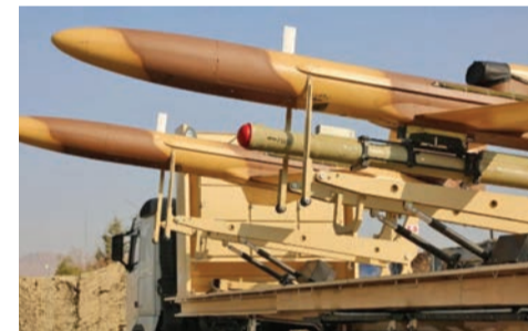
IRGC has launched missiles from twin launch systems for the first time in its retaliatory strikes against the US-Israeli aggression that began 40 days ago.

The statement emphasized that Iran will retaliate proportionally against assaults on critical infrastructure. "We will deal with the infrastructure of America and its allies in a way that deprives them of the region's oil and gas for years," it warned.