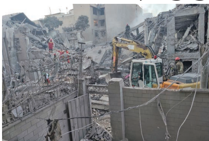
A US-Israeli projectile demolished a synagogue in central Tehran on Tuesday.

The association emphasized unity with the broader Iranian nation: "The Iranian Jewish community, while condemning the heinous attacks by the American-Zionist enemy on our beloved homeland and the Rafi-Nia Synagogue, affirms its historic unity with the Leader, the Iranian nation, and the courageous defenders of