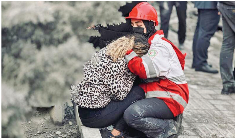
Aid worker comforts an Iranian women after a U.S.-Israeli airstrike in Tehran