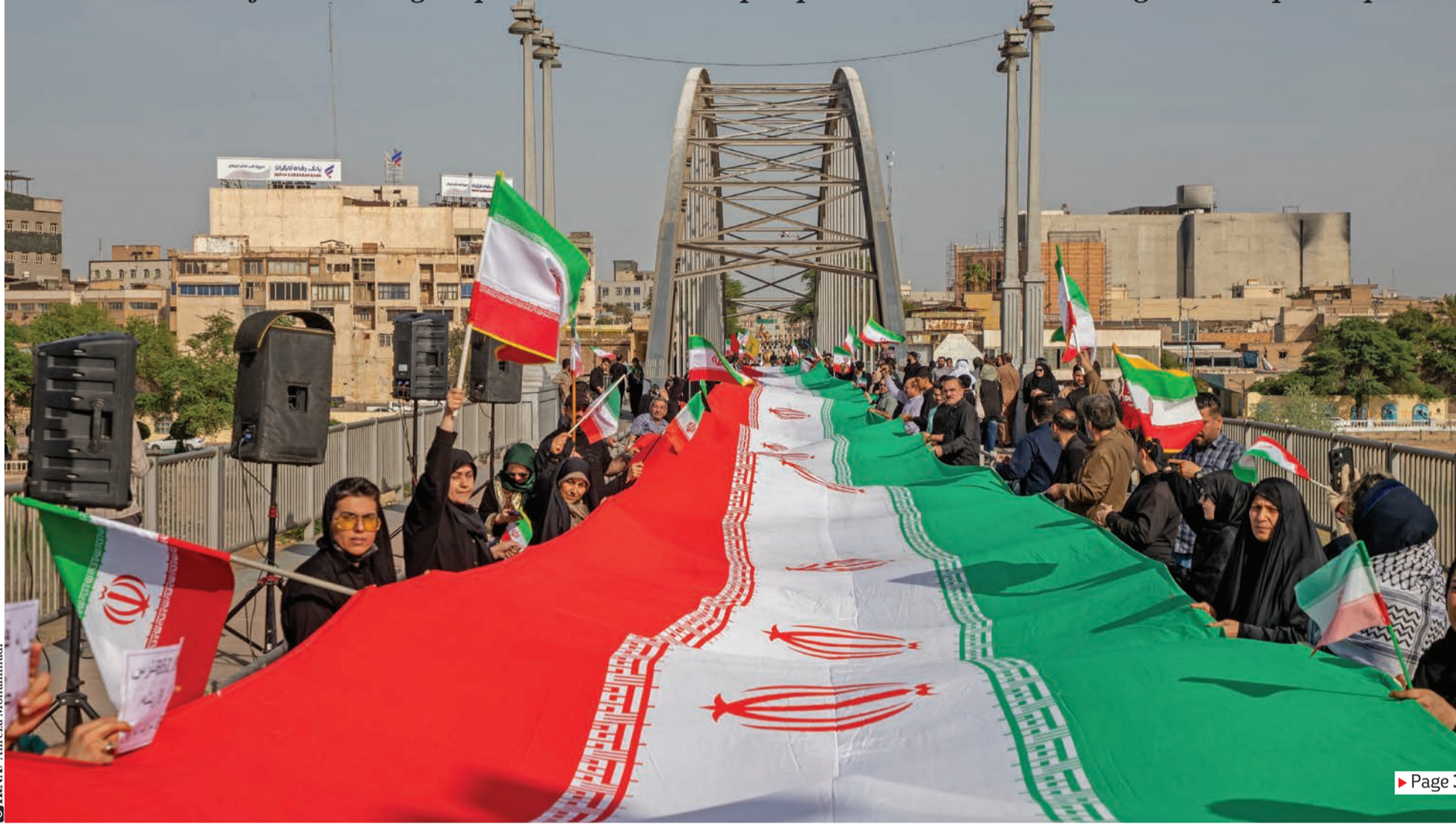
Iranian citizens form human chains on a bridge in the southern city of Ahvaz on April 7, 2026, following Trump's threat to strike Iranian infrastructure en masse

IRGC warns of devastating response should Trump expand war crimes and target Iran's power plants