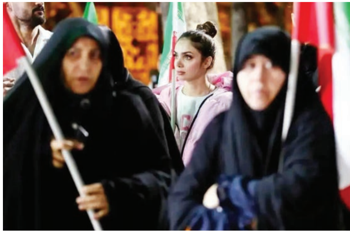
izing enemy's attempts to sow panic and unrest.

Equally critical, though less visible, is the role women have played in maintaining social cohesion and psychological resilience. In what can be described as a parallel “media war,” women have been at the forefront of countering fear, rumor, and disinformation. Through both formal and informal channels, ranging from professional media work to everyday communication within communities, they have contributed to a narrative of calm and continuity. Their efforts have been instrumental in neutral-