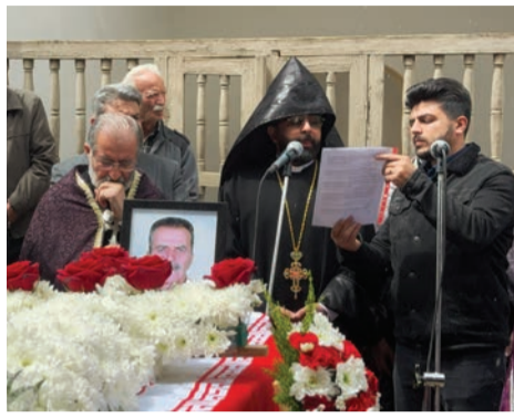
Funeral ceremony of an Armenian-Iranian soldier martyred in the recent US-Israeli war on Iran, Saint Mary Church in Isfahan.