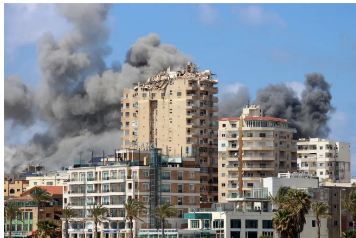
Smoke rises from the site of an Israeli attack that targeted an area in Tyre, southern Lebanon, on April 8.

Nonetheless, on Wednesday, the Israeli military carried out a large wave of airstrikes across Lebanon, with reports of high casualties nationwide. Hospitals have been overwhelmed, and many people are believed