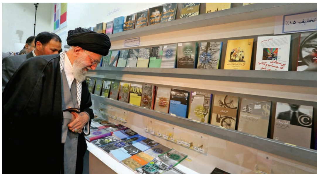
Ayatollah Seyyed Ali Khamenei visits the Tehran International Book Fair in May 2016.

The Minister of Culture and Islamic Guidance Seyyed Abbas Salehi has also recounted a memory of the Leader: "In 1978, following the attack by the Pahlavi regime on Imam Reza (AS) Hospital in Mashhad, a 14-day sit-in was organized by the Leader and the city's scholars. It was said that during this