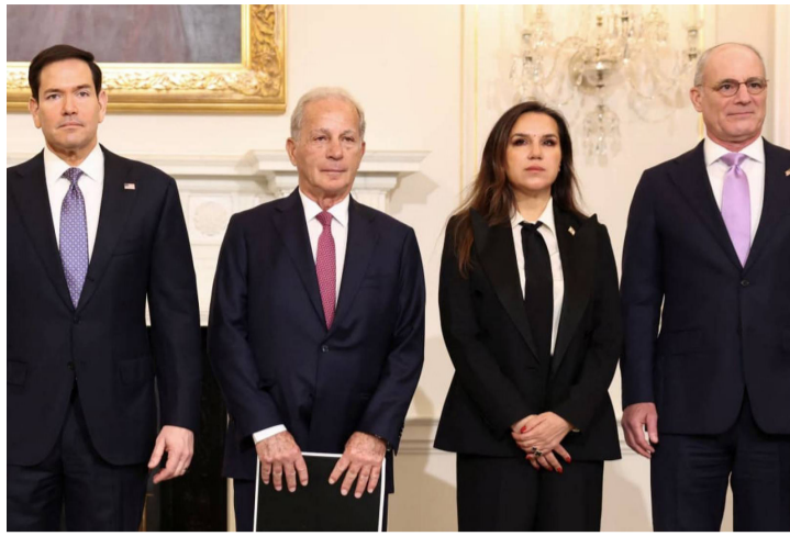
U.S. Secretary of State Marco Rubio, U.S. Ambassador to Lebanon Michel Issa, Lebanon’s Ambassador to the U.S. Nada Hamadeh Moawad, and Israeli Ambassador to the U.S. Yechiel Leiter at the U.S. State Department

The statement stressed that what the occupation regime’s leaders announce regarding their settlement projects in Lebanese lands confirms their persistent ambitions for land, water, and natural resources, seek-