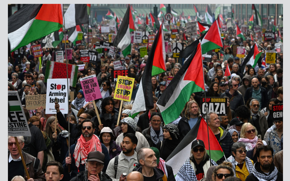
Demonstrators pack the streets of London for the Nakba 78 March for Palestine on May 16, 2026, raising a massive wave of flags alongside prominent signs reading “Stop Arming Israel” and “Stop Bombing Gaza.”

Without that, the ICC’s efforts will serve mainly as footnotes in the continuing story of a broken global order that functions as a post-mortem archive for the dead rather than a shield for the living.