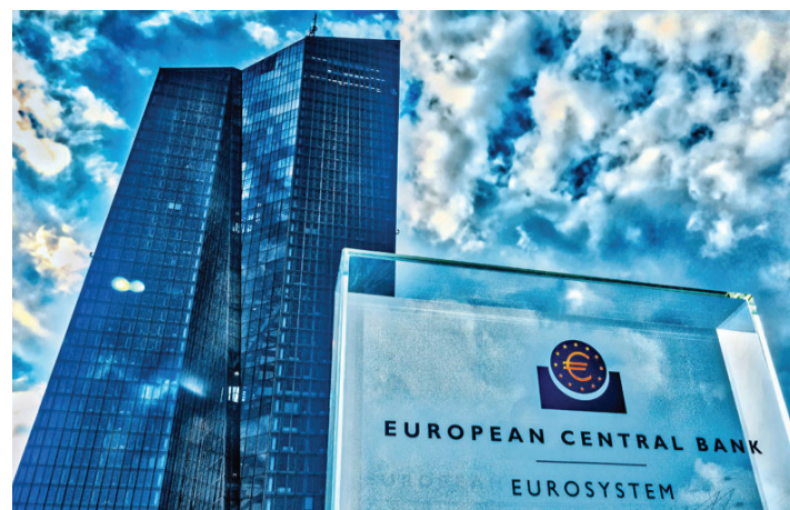
Strait of Hormuz.

The ECB said the conflict has significantly altered the economic outlook for the euro area, primarily through soaring energy costs caused by disruptions to global oil and gas supplies. The war, which has passed the 100-day mark, has contributed to a severe energy shock following damage to regional energy infrastructure and disruptions to shipping routes, including the strategically important