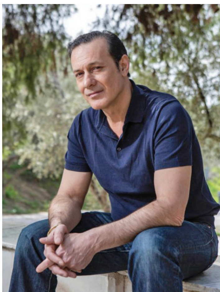
Upon completion of the course, International Theater Office, participants will be awarded official

Due to the specialized nature of the program, participation is limited to 20 individuals. Applicants are required to submit their resumes via the official website (www.artfest.ir) by Wednesday, June 17, for the selection process.