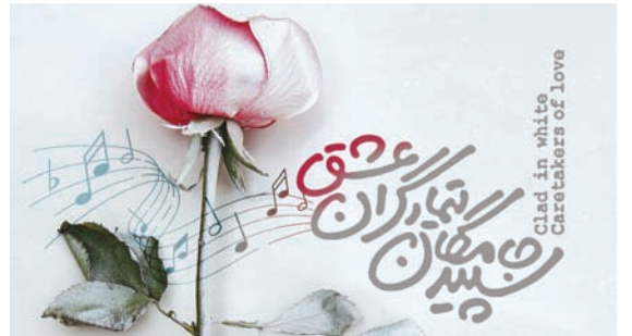
A poster for the Clad in White, Caretakers of Love music festival.

The Iranian National Commission for UNESCO will publish a selection of the submissions on its Instagram.