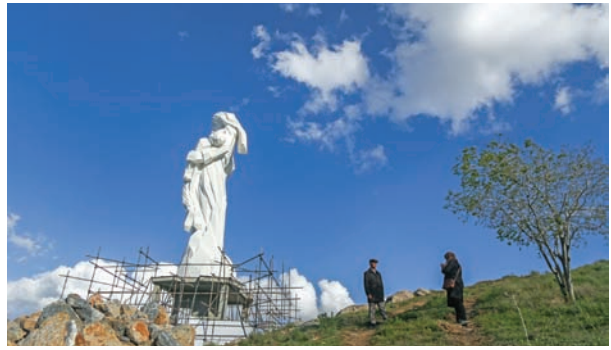
A man poses for a photo by the huge sculpture in Abidar Park in the western Iranian city of Sanandaj in an undated photo.

"Huge sculptures are something common in other countries but have been missing in Iran. We could even make a sculpture twice as large and taller than this," he added.