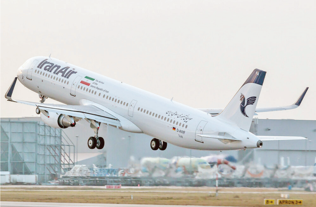
An Iran Air aircraft takes off from the International Imam Khomeini Airport in an undated photo.

Some experts expect Iran to achieve a tourism boom after coronavirus contained, believing its impact would be temporary and short-lived for a country that ranked the