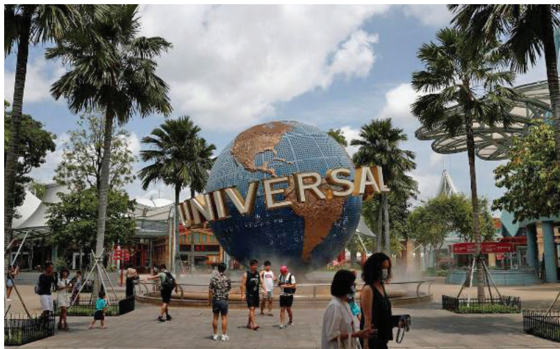
People pose for photos at Universal Studios Singapore in Sentosa March 4, 2020.

NEW YORK (Reuters) — Comcast Corp (CMCSA.O) owned NBCUniversal is evaluating a significant reduction of staff across its portfolio of media and entertainment properties as part of a cost-cutting effort, the Wall Street Journal reported on Friday, citing people familiar with the matter.