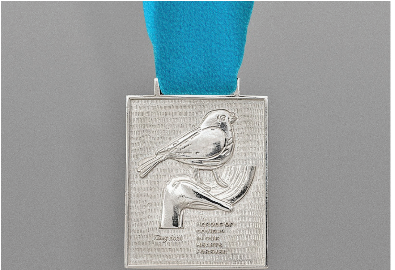
Parviz Tanavoli's medallion, which he is selling

The medallions are set against a background of hundreds of vertical lines