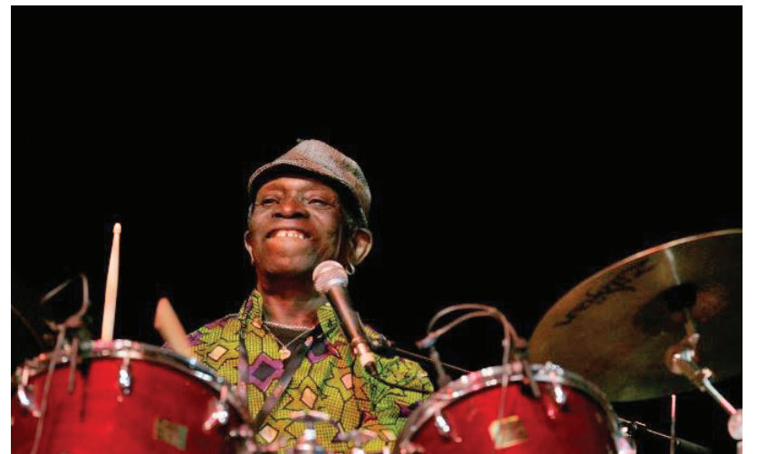
Nigerian singer Tony Allen performs at the Mawazine Festival in Rabat, May 17, 2008.

LAGOS (Reuters) — Nigerian drummer and composer Tony Allen, who worked closely with musician Fela Kuti as a pioneer of the Afrobeat genre, died in Paris aged 79, his manager said.