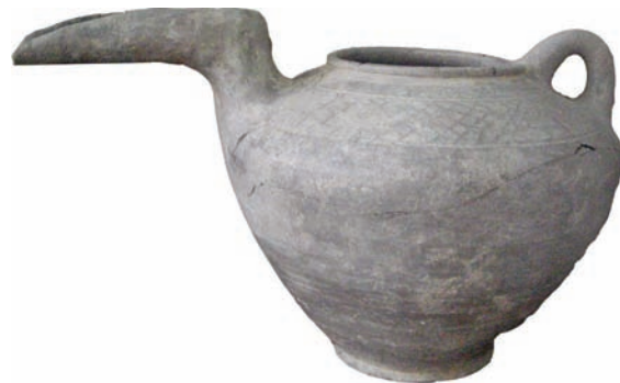
Pottery spouted vessel, unearthed from Ozbaki Tepe, Nazarabad, 2nd millennium BC, National Museum of Iran

Studies also suggest that the discovery of objects