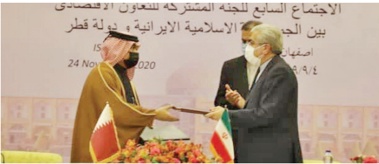
Iranian Energy Minister Reza Ardakanian (R) exchanges signed MOU documents with Qatar's Minister of Commerce and Industry Ali bin Ahmed Al Kuwari in Isfahan on Tuesday.

The MOU also covered cooperation in the fields of pharmaceutical and medical equipment, higher education and scientific research, transit and transportation of goods, communications and information technology, as well as protection and maintenance of fiber optic cables (submarine).oto: