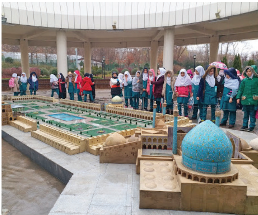
Students visit a giant model of the UNESCO-registered Imam Square at Tehran's Miniature Garden Museum.

The replicas are at one twenty-fifth of their original size. One of the complex's highlights is probably the 17th-century Naghsh-e Jahan (Imam) Square that itself is composed of the Royal Mosque, the Ali Qapu Palace, the Mosque of Sheikh Lotfollah, the magnificent Portico of Qaysariyeh, and a 15th-century Timurid palace all linked by a series of two-storied arcades.