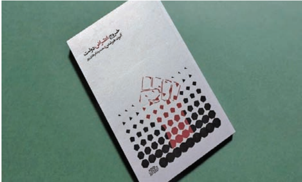
A copy of the Persian translation of Albert O. Hirschman’s “Exit, Voice, and Loyalty”.

An innovator in contemporary thought on economic and political development looks here at decline rather than growth.