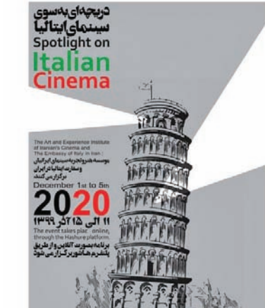
A poster for the Italian festival “Spotlight on Italian Cinema”.

However, it was canceled three days after its opening due to the shutdown of the cultural centers and programs in Iran following the outbreak of coronavirus.