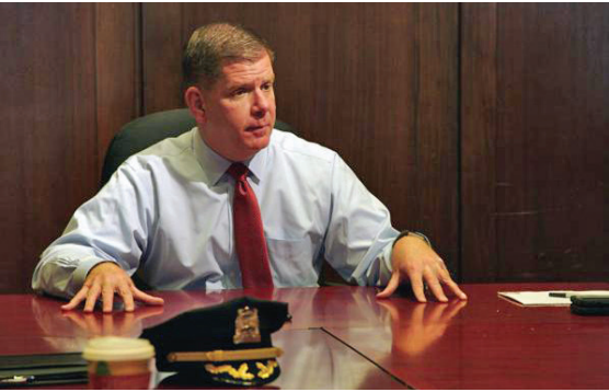
“City Hall” by Frederick Wiseman.

A R T d e s k TEHRAN — “City Hall”, Frederick Wiseman’s documentary that shows why government is necessary for people to successfully live together, will be screened at the 14th edition of Cinéma Vérité, Iran’s major international festival for documentary films.