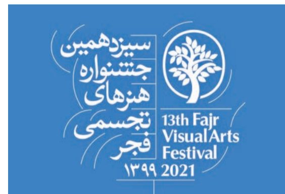
A poster for the 13th Fajr Festival of Visual Arts.

He also said that an exhibition of lithographs by curator