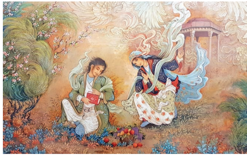
An artwork from the 10th National Biennial of Persian Painting held at the Tehran Museum of Contemporary Art in January 2017.

"A large number of Persian painters and artists in other fields were taken captive by the Ottomans during Sultan Selim's raid on