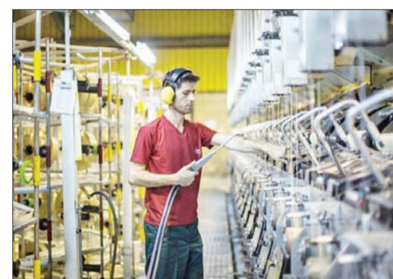
of liquidity, problems in terms of supplying raw materials and machinery, and absence of market are the main reasons making the units inactive.

According to Mosaheb, preventing the inactive status of the industrial units is a major plan of ISIPO, while lack