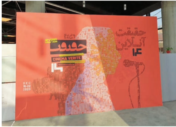
This photo shows a poster for the 14th Cinéma Vérité festival.

Due to the pandemic, the festival was organized entirely online while the international section of the festival is non-competitive this year.