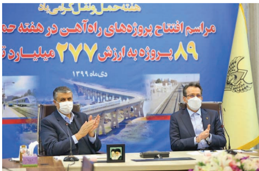
Transport and Urban Development Minister Mohammad Eslami (L) and RAI Head Saeed Rasouli attend the inauguration ceremony of rail projects in Tehran on Monday.

new railways are under construction across the country, of which eight projects with a length of 1560 km are the Transport Ministry's priority.