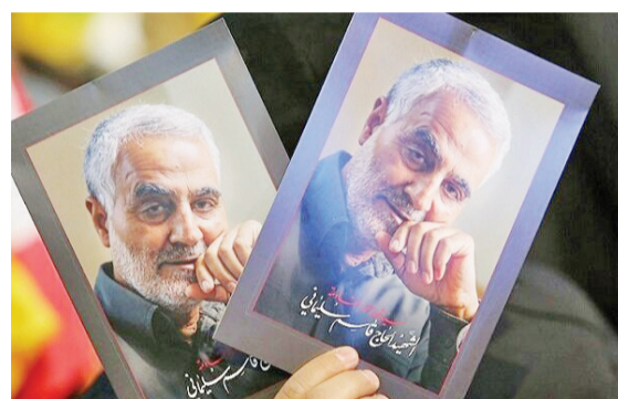
A poster of Commander Qassem Soleimani.