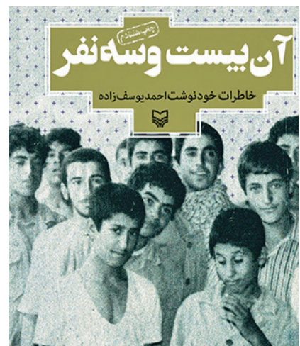
Front cover of the book "Those 23 Individuals" by Ahmad Yusefzadeh.

The awards are presented to those films that promote issues being pursued by some public organizations and institutes.