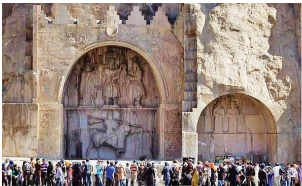
Anahita with ring and jar (Taq-e Bostan); the larger cave, western Iran; 590 CE - 628

Possibly of Mesopotamian origin, her cult was made prominent by Artaxerxes II, and statues and temples were set up in her honor throughout the Persian empire.