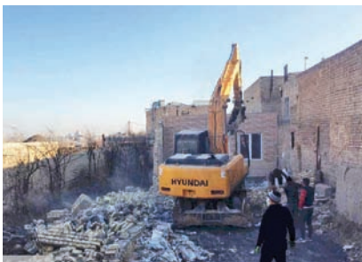
So far, a total of twelve same decrees of destruction have been executed within the demarcated properties of the hill,

Unfortunately, in recent years, several illegal constructions have been carried out within the legal properties of Tapeh Sialk ("Sialk hills"), which is one of the most valuable ancient sites in the world, causing irreparable damage to visual elements of the ancient hill, CHTN quoted a local tourism official as saying on Thursday.