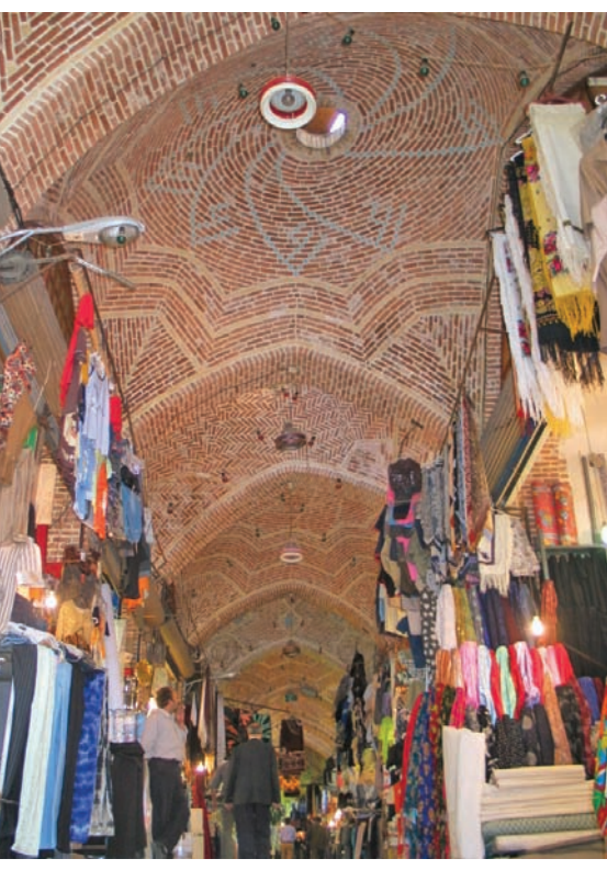
dition. The province is very cold in winter and mild in summer, attracting thousands every year. The capital city of Ardabil is usually recorded as one of the coldest cities in the country in winter.

Sprawling on a high, windswept plateau, whose altitude averages 3,000 meters above sea level, Ardebil is well-known for having lush natural beauties, hospitable people, and its silk and carpet trade tra-