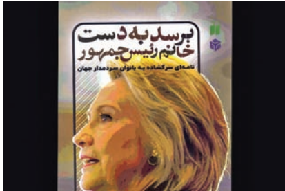
Front cover of the Persian translation of Jennifer M. Palmieri’s “Dear Madam President: An Open Letter to the Women Who Will Run the World”.