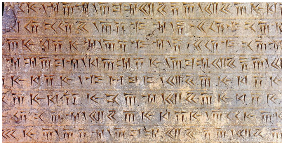
An Old Persian inscription in Persepolis.