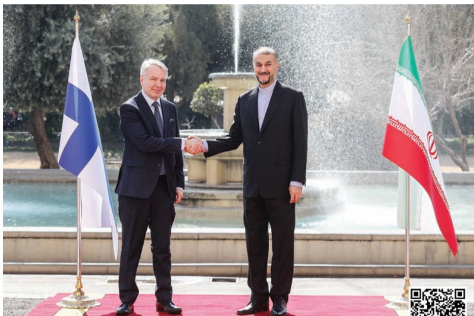
Iran, Finland stress joint cooperation TEHRAN — Iranian Foreign Minister Hossein Amir Abdollahian and his Finnish counterpart Pekka Haavisto held talks in Tehran on Monday. The two chief diplomats discussed bilateral relations. The two said the level of trade between the two countries is unsatisfactory. Page 2

Some 17 specialized meetings and workshops in various fields including downstream petrochemical and polymer Page 4