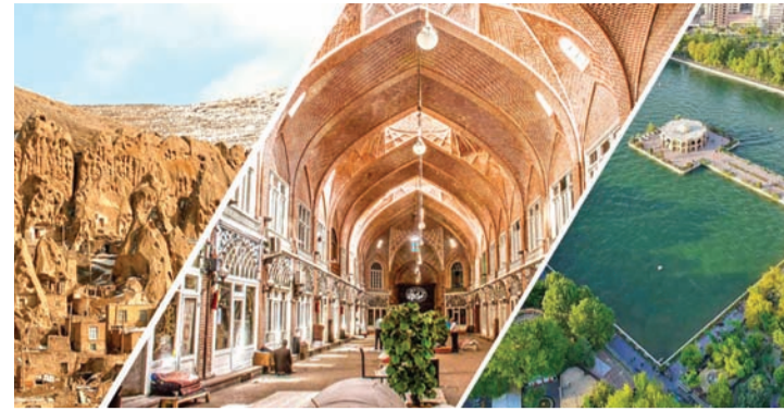
From left to right, a photo combination depicts the rocky village of Kandovan, the UNESCO-registered Bazaar of Tabriz, and Shahgoli Park as some gorgeous travel destinations of Tabriz, northwest Iran.

There are several food stalls around the park and outside the park's perimeter, and an upscale restaurant in the center of it. An artificial lake rings the park walkway, making it particularly pretty in the evening.