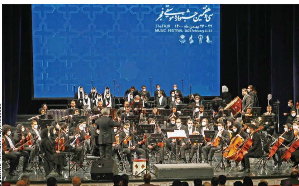
Fajr Music Festival pays tribute to General Soleimani The IRIB Symphonic Orchestra performs the symphonic poems "Arvand" and "The Soldier" in memory of Lieutenant-General Qassem Soleimani during the opening ceremony of the 37th Fajr Music Festival at Tehran's Vahdat Hall on February 11, 2022. The symphonic poems, both produced at the Art and Cultural Organization of the Tehran Municipality, were also performed by the orchestra at the hall to commemorate the second martyrdom anniversary of the former IRGC Quds Force chief who was assassinated in a U.S. airstrike in Baghdad on January 3, 2020.

As the closing ceremony of the festival was underway at Tehran's Milad Tower on Friday night, the organizers found that the winners list had been published earlier on a Persian news website. ▶ Page 8